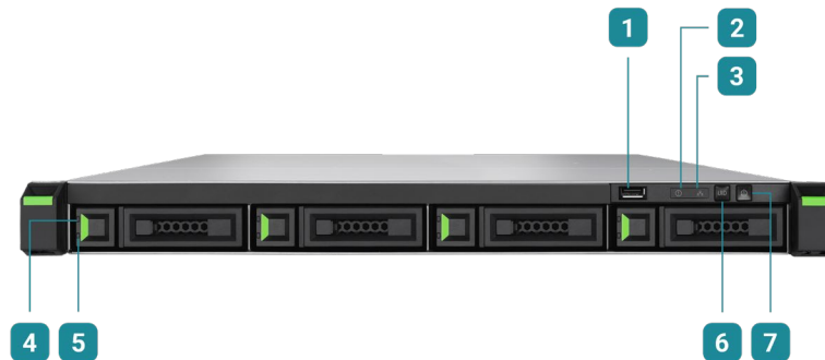
Figure 2-1 System Controls and Indicators

The XCubeNAS series features a unique design: the system controls and indicators are located on the right ear. The system controls and indicators module integrates functional buttons and system state indicators, which can be easily operated and read by user.